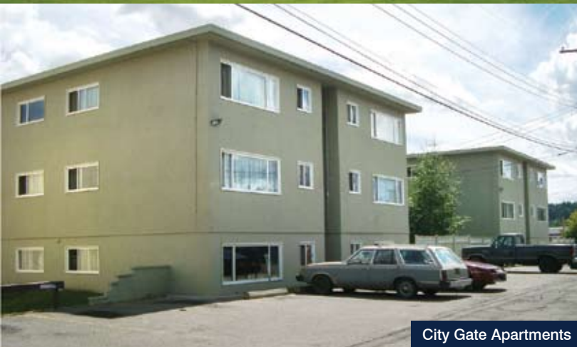
City Gate Apartments