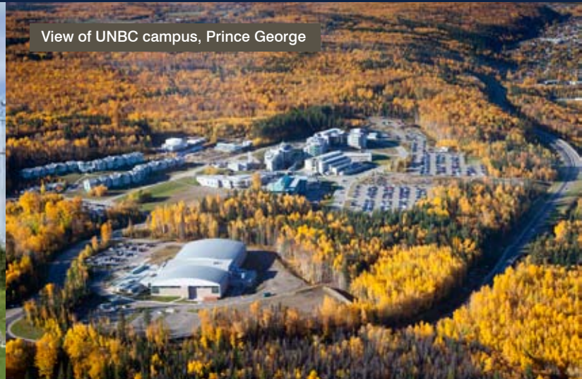
View of UNBC campus, Prince George