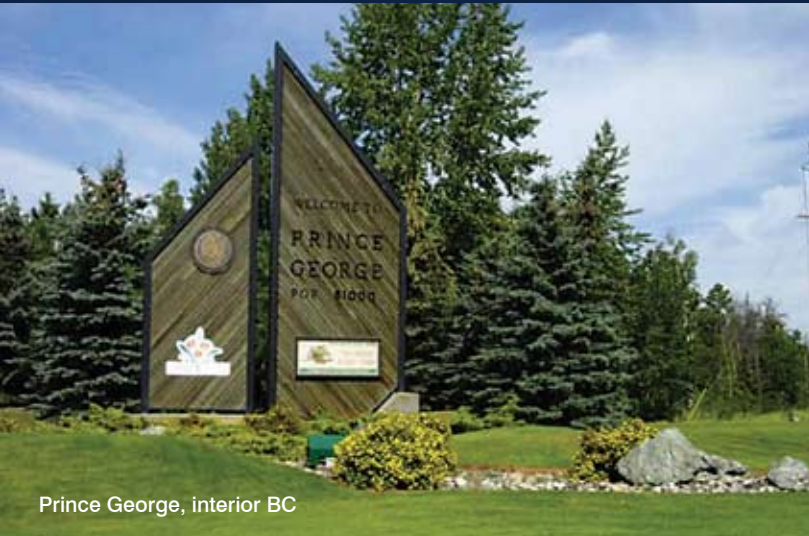
Prince George, interior BC

1601 and 1617 Queensway Street, Prince George, BC