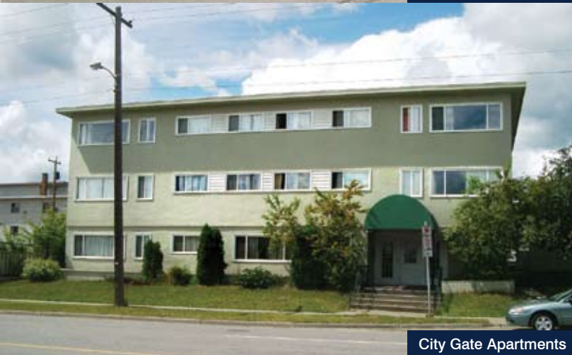
City Gate Apartments