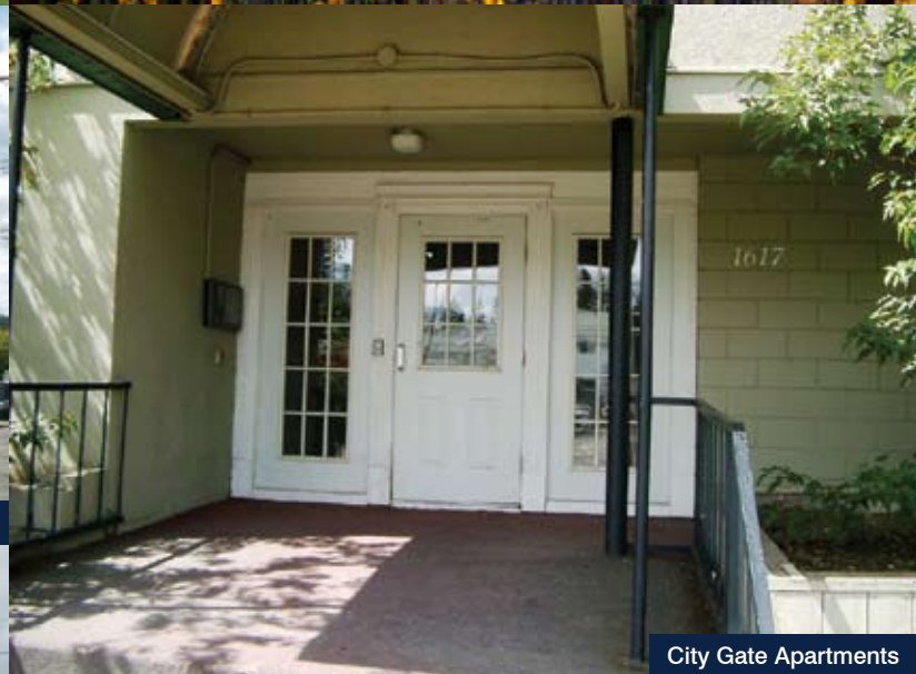
City Gate Apartments